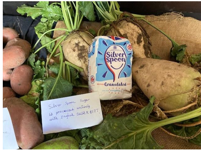
Thanks to Jenny Pile whose farm-based display is a tradition – and the last she will be doing.