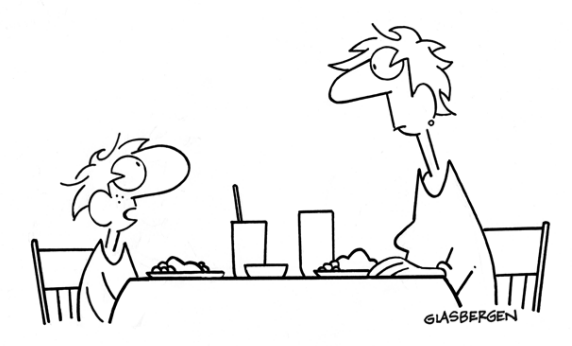
"If God wanted me to eat carrots, He wouldn't hide them underground!"